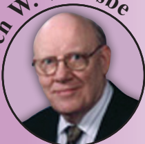
Warren W. Wiersbe

“If you’re weary of meetings where you’re a statistic instead of a person and where they try to minister to people by the acre, then the RHMA conference is for you. The speakers come from the trenches, not from ivory towers, and the sessions are practical because they deal with what’s going on today. You’ll feel right at home, believe me!”